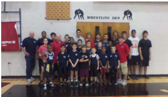
PAL Wrestlers at the Rumble in the Jungle