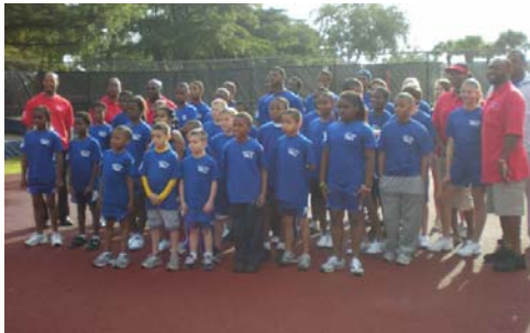
2009 PAL Track Club

Registration is $90, and parents should bring a copy of their child's birth certificate and a recent photo of their child. The program is designed for boys and girls ages 7 to 18.