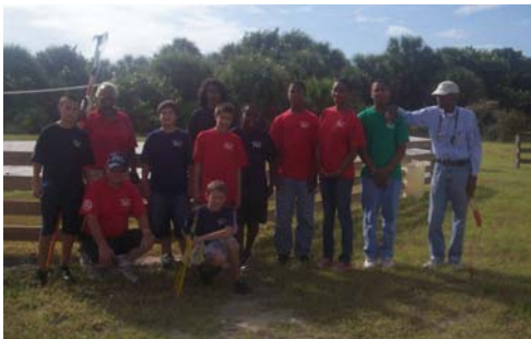
Youth Directors working at Fort Pierce Inlet State Park

On October 24, Youth Directors had two service opportunities. In the morning, several members worked at the Fort Pierce Inlet State Park, helping rangers inoculate red bay laurel trees against a disease that is threatening to wipe out this native species.