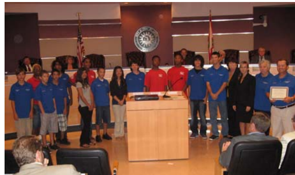
Youth Directors receiving award at City Council meeting of October 26, 2009