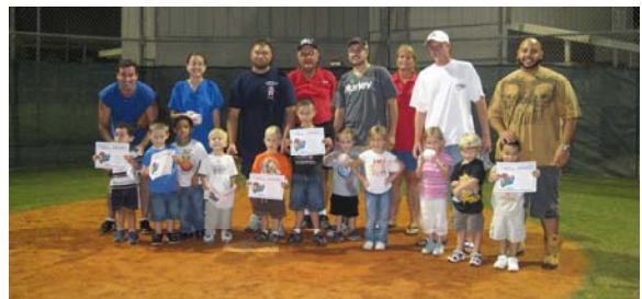
Pre T-Ball Camp at Lyngate Park

In November, the camps will be held from 10 am until 12 noon on Tuesdays, November 3, 10, 17, and 24 at Whispering Pines Park.