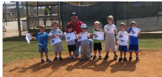
Pre T-Ball Camp at Whispering Pines Park

The camps, held at Whispering Pines Park in the mornings and Lyngate Park in the evenings, gave young boys and girls the chance to improve their skills in running, throwing, hitting, and fielding.