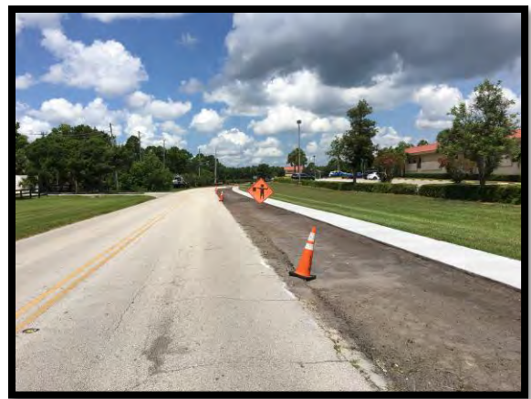
Hillmoor Drive Sidewalk Project