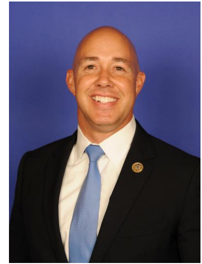
U.S. Congressman Brian Mast