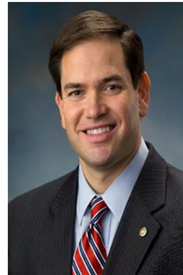
U.S. Senator Marco Rubio