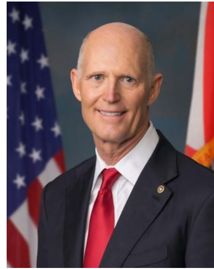
U.S. Senator Rick Scott