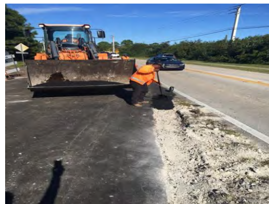
Torino Pkwy at California Blvd