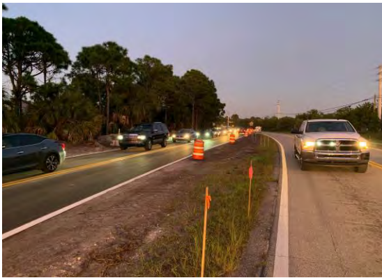
Torino Pkwy at Cashmere Blvd

1 Total contract for construction of both Torino roundabouts is $1,392,059.44.