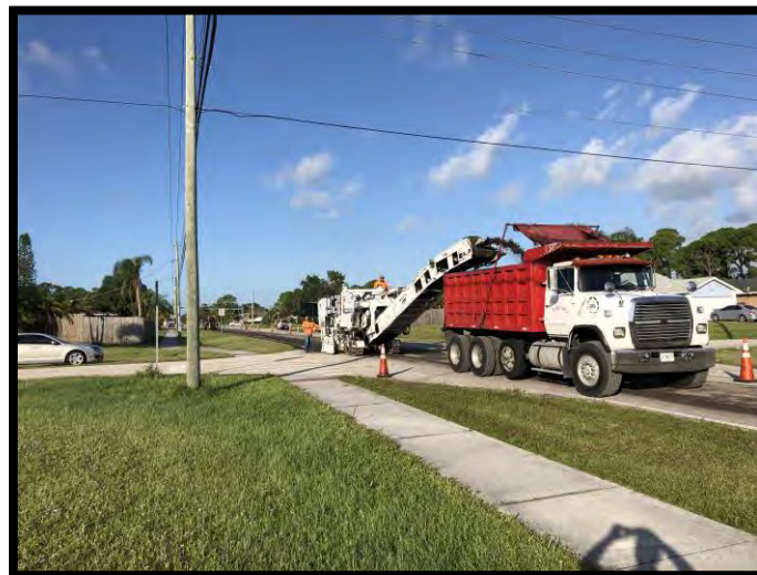
SE Thornhill Drive

1 The above repaving contracts include $240 per project that will be charged to Utilities.