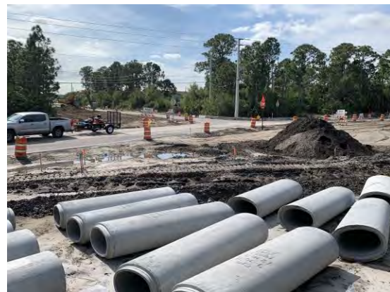
Torino Pkwy at California Blvd