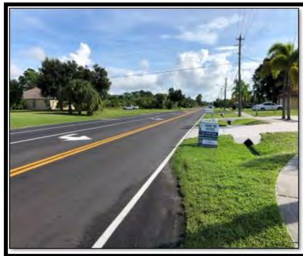
SE Thornhill Drive

1 The above repaving contracts include $240 per project that will be charged to Utilities.