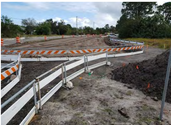
Torino Pkwy at Cashmere Blvd

1 Total contract for construction of both Torino roundabouts is $1,392,059.44.